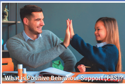
What Exactly Is Positive Behaviour Support (PBS)?