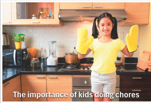
The Importance Of Kids Doing Chores