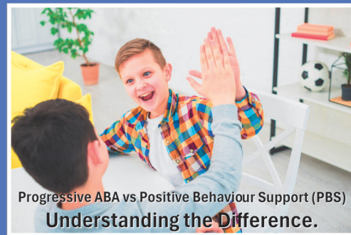
What's The Difference Between PBS & Progressive ABA?