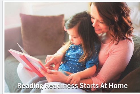
Reading Readiness Starts At Home