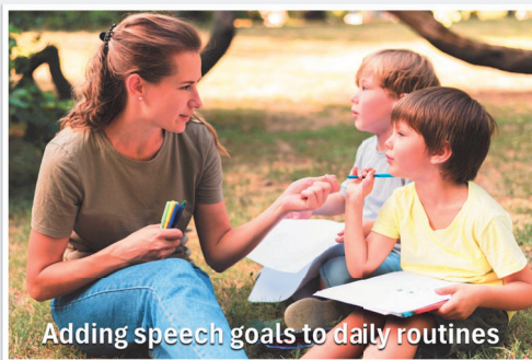
Adding speech goals to daily routines

Including speech goals in everyday activities