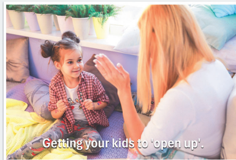
Getting your kids to 'open up'.

Including speech goals in everyday activities